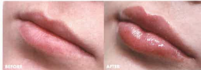
Actual patient treated with 1.2mL. Individual results may vary and might require multiple treatment sessions.