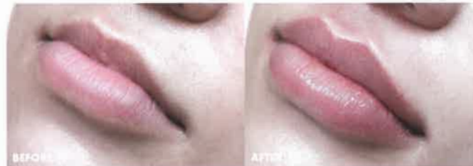
Actual patient treated with 1.2mL. Individual results may vary and might require multiple treatment sessions.