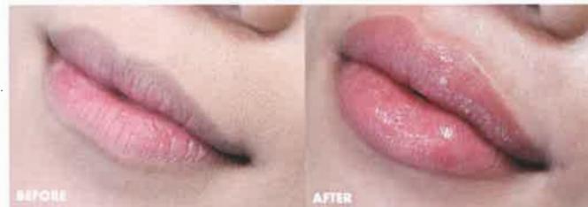
Actual patient treated with 1.2mL. Individual results may vary and might require multiple treatment sessions.